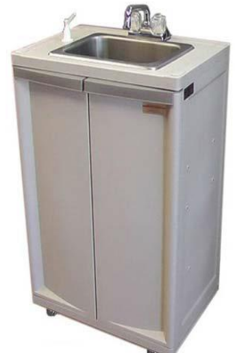
A. Hand Washing Setup