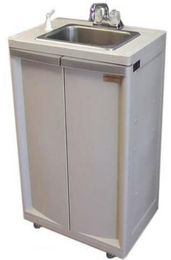
A. Hand Washing Setup